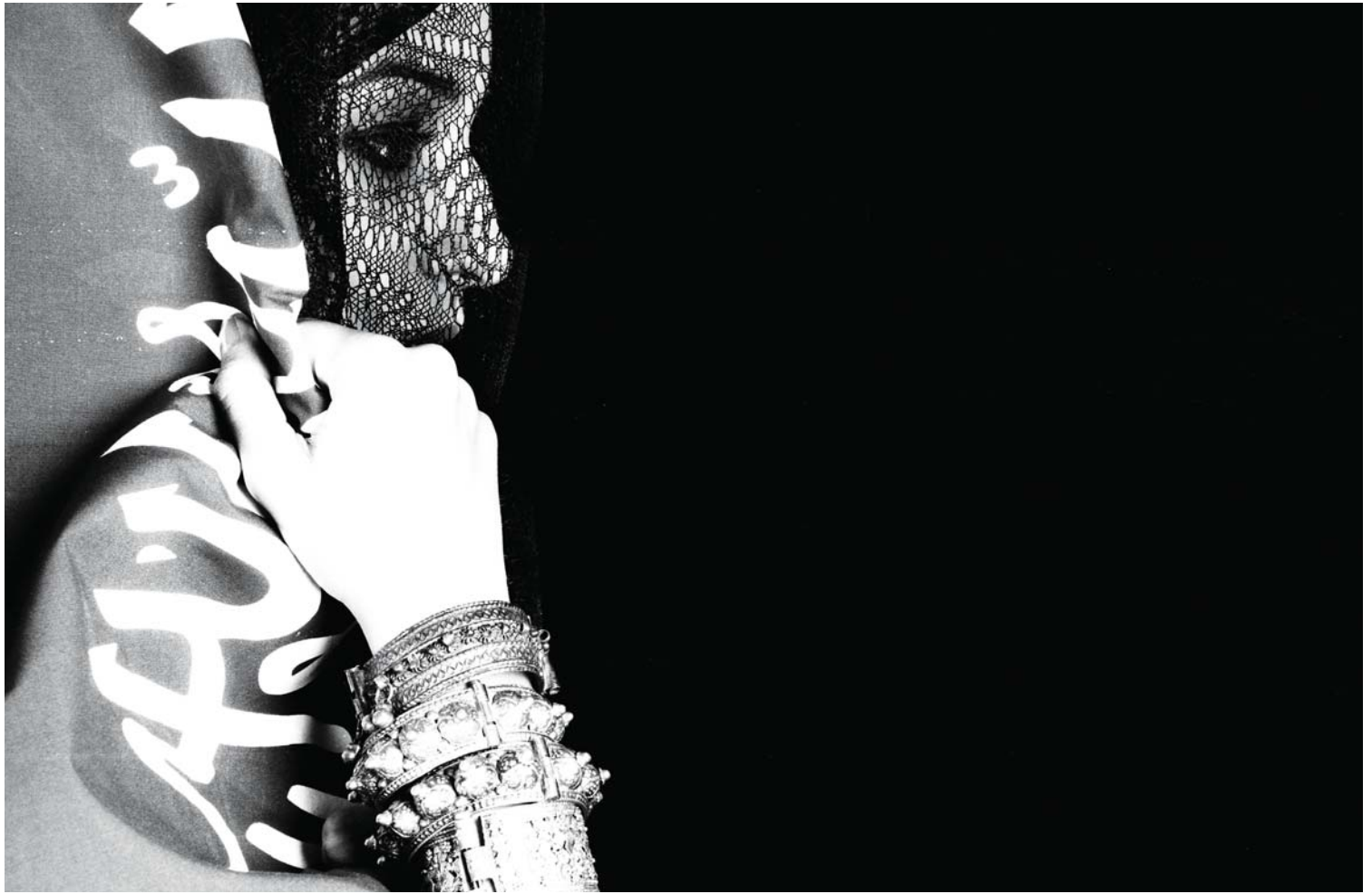
From the series I am by Manal Al Dowayan